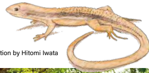
Illustration by Hitomi Iwata