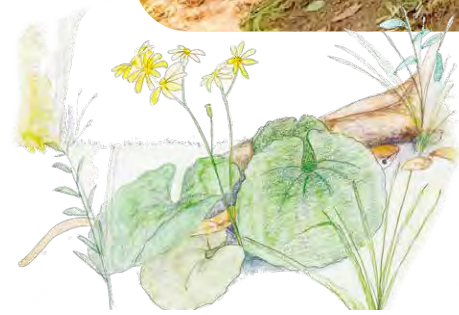
Illustration by Hitomi Iwata

S-child RINKU NURSERY SCHOOL is a licensed nursery school located in AEON MALL Tokoname that accepts children 365 days a year from early morning to night. The school adopts a mixed-age group childcare, supporting children's growth beyond standard age-based class divisions.